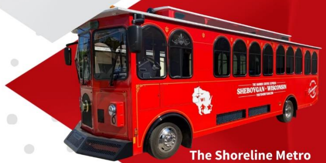
The Shoreline Metro Trolley purchased in 2021.